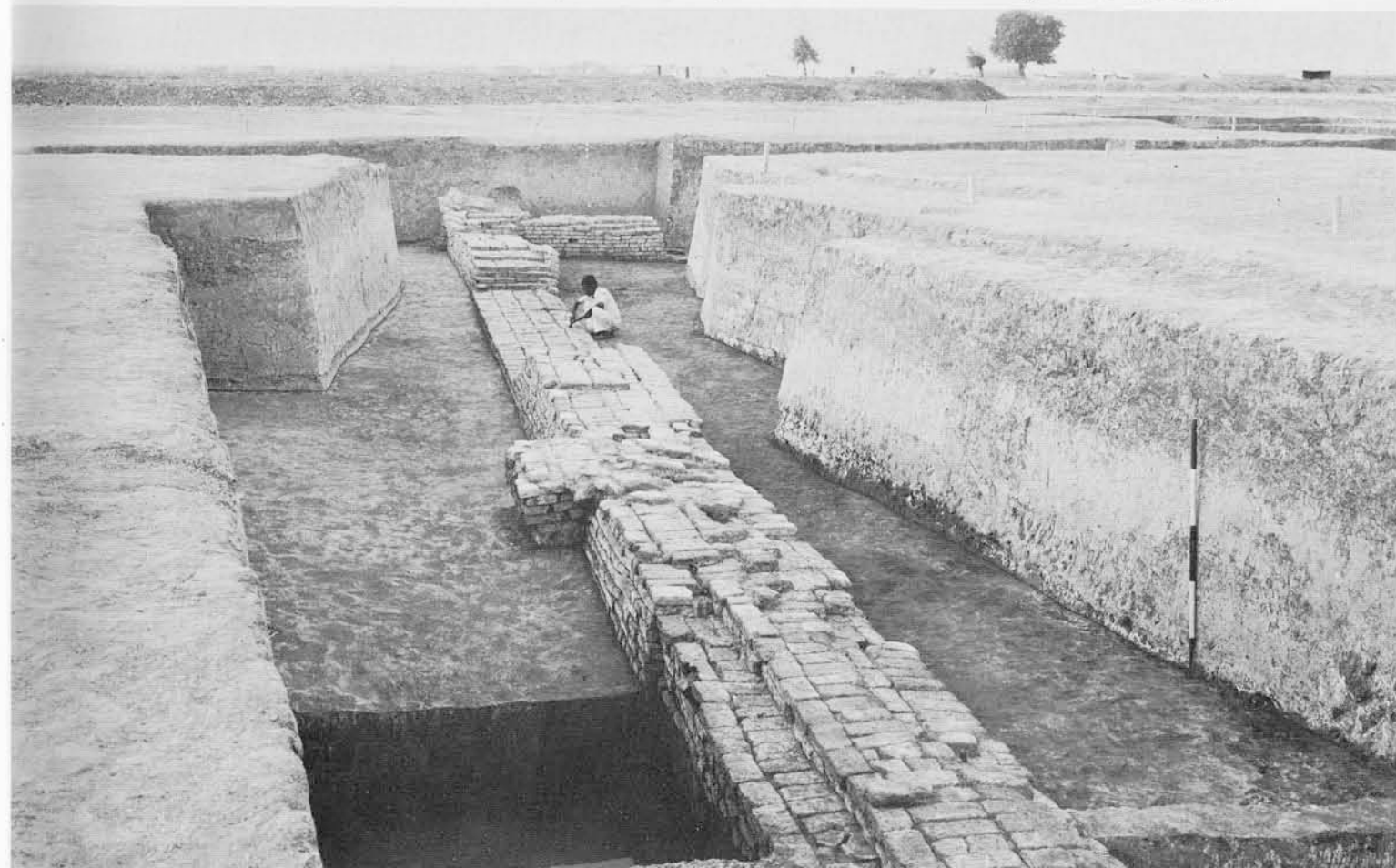
Inlet of the second stage in the eastern embankment of the dock at Lothal.