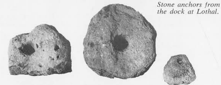
Stone anchors from the dock at Lothal.