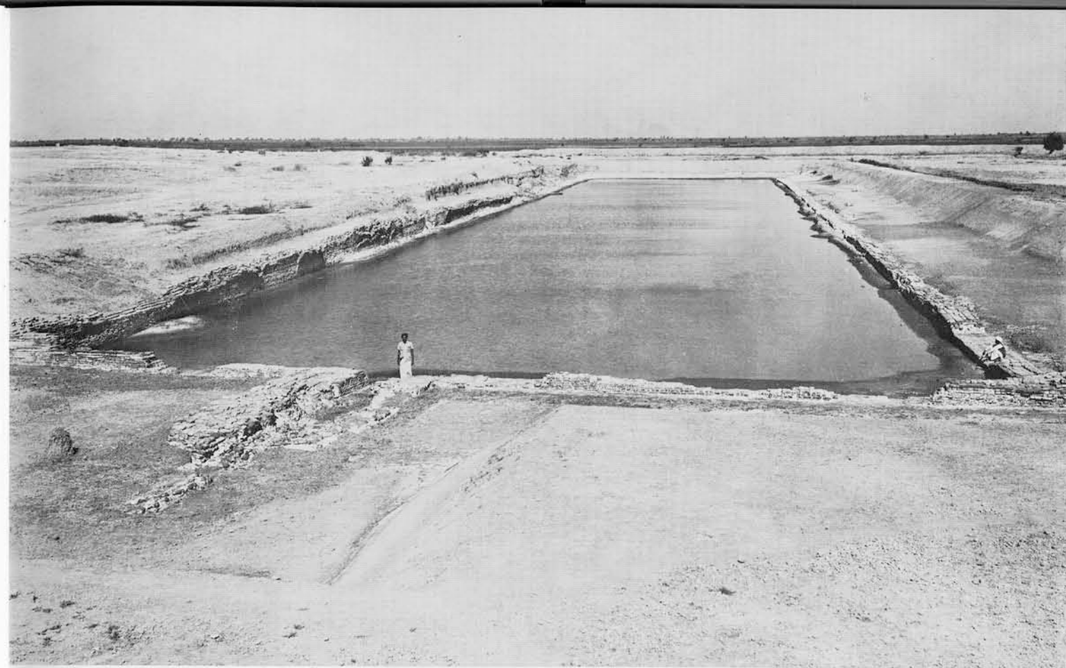
The dock at Lothal. The figure in the foreground is standing near the spillway; the figure on the right is sitting in the inlet of the second stage.