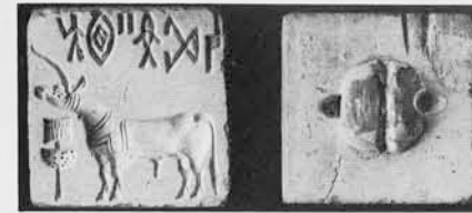
Typical Indus seal (left) and a circular seal from Bahrein, both found at Lothal. They are of steatite.

The principal exports of Lothal were ivory, shell inlays and ornaments, beads of gemstones and steatite, and, perhaps, cotton and cotton goods. Bhal, the alluvial flat where Lothal is situated, has long been famous for its cotton. The Kathiawar coast abounds in conch shell. The raw material and rejected pieces of shell found in the factories outnumber the finished products, suggesting that shell was worked for export. Lothal was also an important center for ivory-working. That elephants were reared here is in-