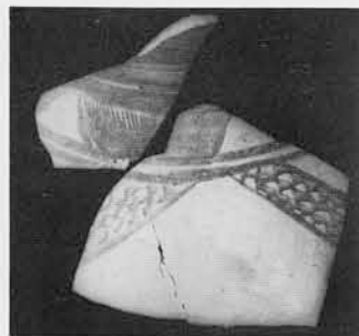
Painted motif on potsherds, perhaps representing a multi-oared boat.

It has a sharp keel, a pointed prow, and a blunt stern. A hole visible near the stern was used for tying a rope when the ship had to be towed or secured to a wooden post. It could also be used for fixing a mast. The socket on one of the sides was either used for securing the sail or for resting an oar against a peg. A second type of boat is represented by a single specimen. One of its ends is curved, the other is damaged. Perhaps both the stern and the prow were curved as in the case of the Egyptian boats of the Gerzean period (before 3100 B.C.). A single hole a little away from the center of the floor was meant for fixing the mast. Unfortunately, the prow is damaged. The keel is pointed and the sides are raised. The remaining three models, all damaged, form a distinct group with flat bottom and pointed prow. Possibly the stern was not pointed. No holes are found in any of the three models. Apparently, they represent barges without sails as used on rivers and creeks. The first two types having a sharp keel and with provision for sails represent ships which plied on the high seas. They could enter the dock in the first stage only. In the second stage, flat-bottomed canoes and barges were used for bringing cargo from the ships berthed in deeper waters. A fourth type of boat is suggested by the paintings