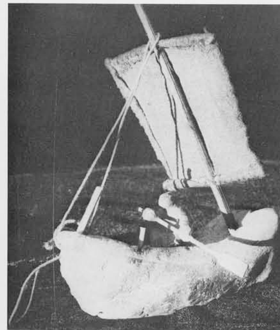
Ship reconstructed from the terracotta model shown at the right. In the model are holes for towing and fixing the mast.

The occurrence of stone anchors in the basin of the Lothal dock indicates that ships were anchored with the help of stones. They were occasionally tied to wooden posts as indicated by the presence of postholes. The position of the anchors indicates the floor level of the basin and allows a calculation of the depth of the water. The height of the existing embankment wall is 2.5 meters, but was originally more. Hence, the maximum depth of water available in the basin must have been at least 3 meters. The height of the water column above the sill of the inlet in the first stage was about 2.5 meters, while in the second it was about 2 meters. It is therefore reasonable to suppose that ships with a draught of 2 to 2.5 meters could enter the dock at high tide through the inlet in the northern embankment (first stage). Later on, it is only smaller ships with a draught of 1.5 to 2 meters that could enter through the inlet in the eastern embankment (second stage).